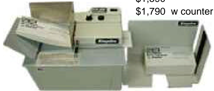
Model MA-1 Operator-fed